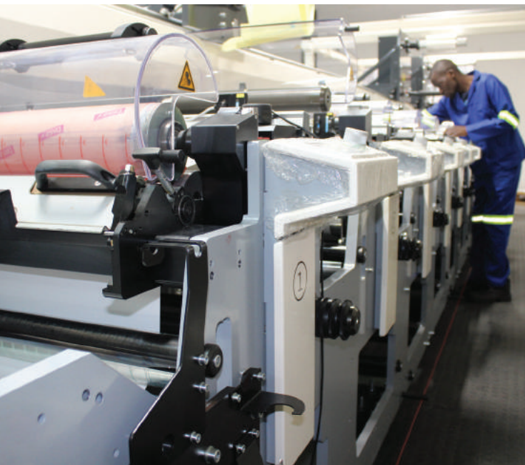
The eight-colour MPS EFS 430 flexo press was jointly installed and commissioned by a Rotocon and MPS technician.