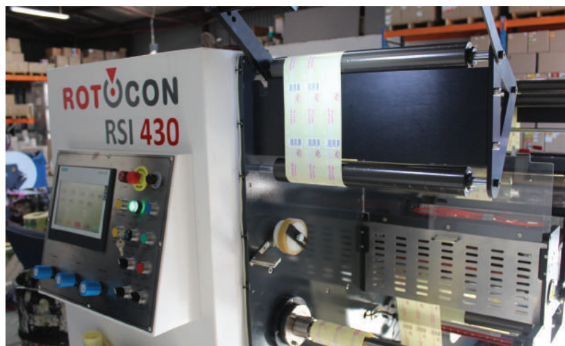
By re-engineering the Ecoline RSI 430 slitting, inspection and rewinding system to a fully servo-driven version, Rotocon has increased output from 230m/min to 300m/min.

Aslam commends Rotocon and MPS for their levels of service and support over the years. 'These partnerships have aided JMB Labels' tremendous growth. The next step in our journey is expanding our facility to almost three times its current size (740m 2 ) by early next year,' he enthuses.